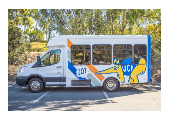
Day 2 = 8 passenger van