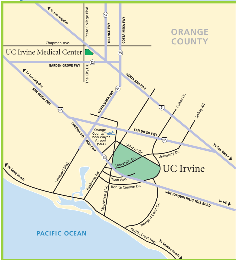
MAPS NOT TO SCALE

The University of California, Irvine is located in coastal Southern California, approximately 40 miles south of Los Angeles and 80 miles north of San Diego. Situated in dynamic Orange County, the main campus in Irvine and UC Irvine Medical Center in the nearby city of Orange are reachable from several major airports, the closest being Orange County/John Wayne Airport (SNA), and by major freeways. For additional maps and driving directions, visit www.uci.edu/campusmaps .